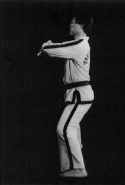
7. Lower the right foot to C, forming a sitting stance toward A, while performing a right inward elbow strike.