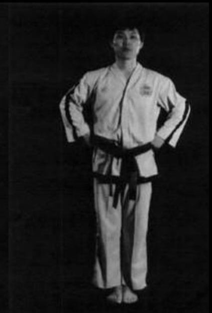
10. Bring the left foot to the right foot, forming a close stance toward D, at the same time thrusting with a twin side elbow.