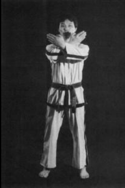
Parallel stance toward D.