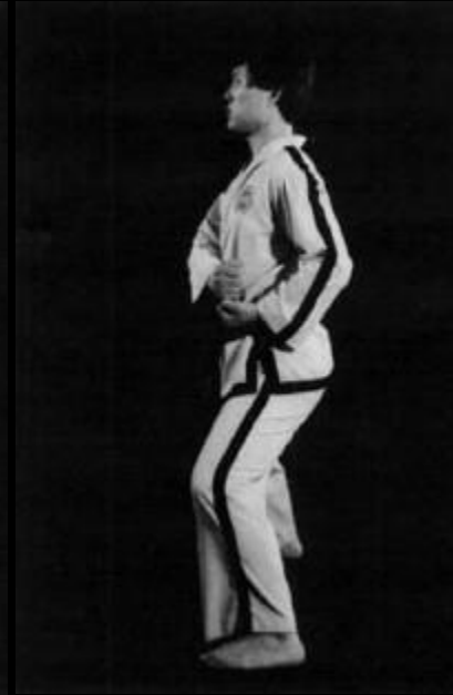
8. Thrust to B with the left back elbow placing the right side fist on the left fist while maintaining a sitting stance toward A.