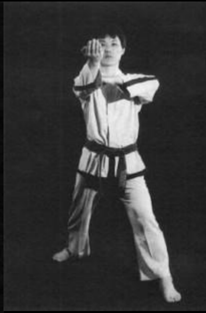
4. Execute a right high front knife-hand strike, bringing the left palm on the right elbow joint, while maintaining a left walking stance toward D.