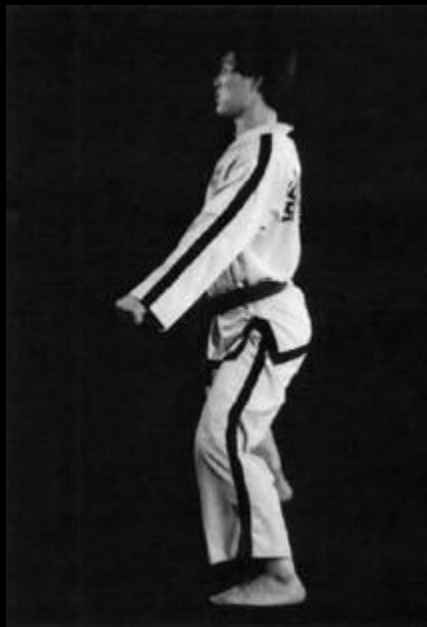
9. Execute a right side back fist strike to B, while extending the left arm to the side downward while maintaining a sitting stance toward A.