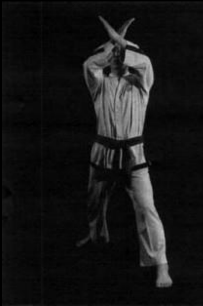
3. Execute an X-knife-hand rising block while maintaining a left walking stance toward D. Perform 2 and 3 in a continuous motion.