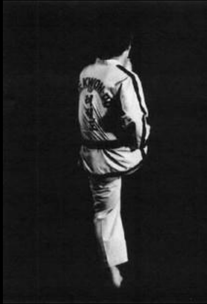
6. Execute a right middle crescent kick to the left palm.