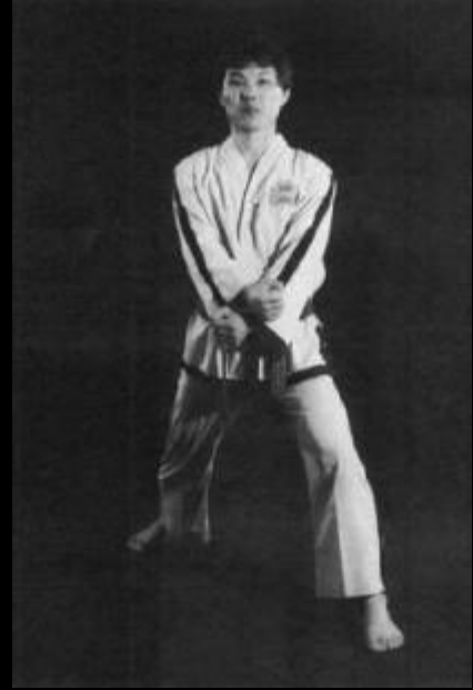
2. Move the right foot to C to form a left walking stance toward D while executing an X-fist pressing block.