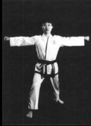
1. Move the left foot to C, forming a right walking stance toward D while executing a twin fist horizontal strike.