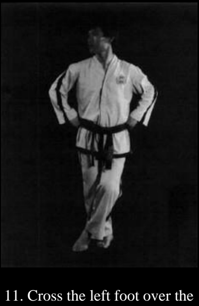
11. Cross the left foot over the right foot, forming a right X-stance toward D while turning to face A, keeping the position of the hands as they were in 10. Perform in a fast motion.