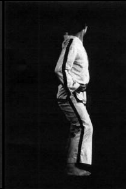
5. Move the left foot to C to form a sitting stance toward B while executing a middle back hand side strike to C.